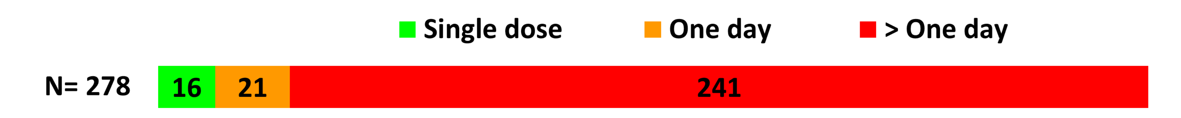
Figure 3. Duration of surgical prophylaxis in adults and children