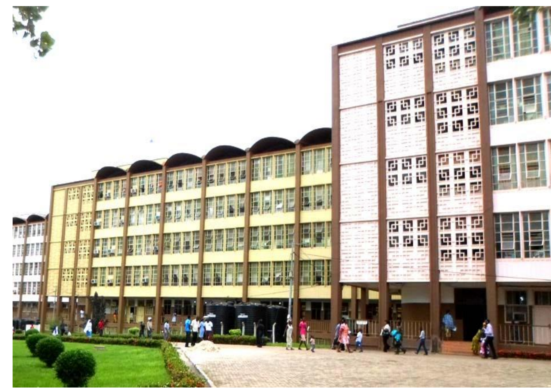
KOMFO ANOKYE TEACHING HOSPITAL